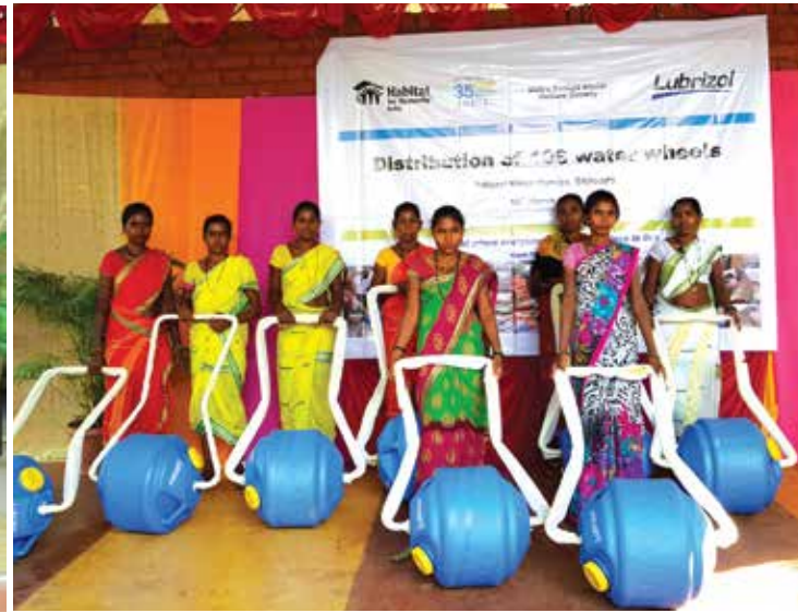
Fractal Analytics and Lubrizol Corporation distributed water wheels to families in Shilonda

Water wheels were distributed to families in the village of Shilonda, Palghar district (Maharashtra) with support from Lubrizol Corporation and Fractal Analytics on 10th and 12th March 2018 by the two organizations respectively.