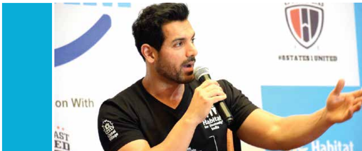
John Abraham pledged his support to Habitat India's Impact Assam initiative

On 15th February 2018, acclaimed Indian film actor, national award winning producer and Bollywood superstar John Abraham honored Habitat India's 'Impact Assam' initiative that focuses on rebuilding the lives of families affected by the devastating Assam floods of 2017. The event witnessed the presence of over 65 esteemed representatives from various walks of life including government bodies, corporates, schools and the media. Impact Assam initiative is supported by the North East United Football Club.