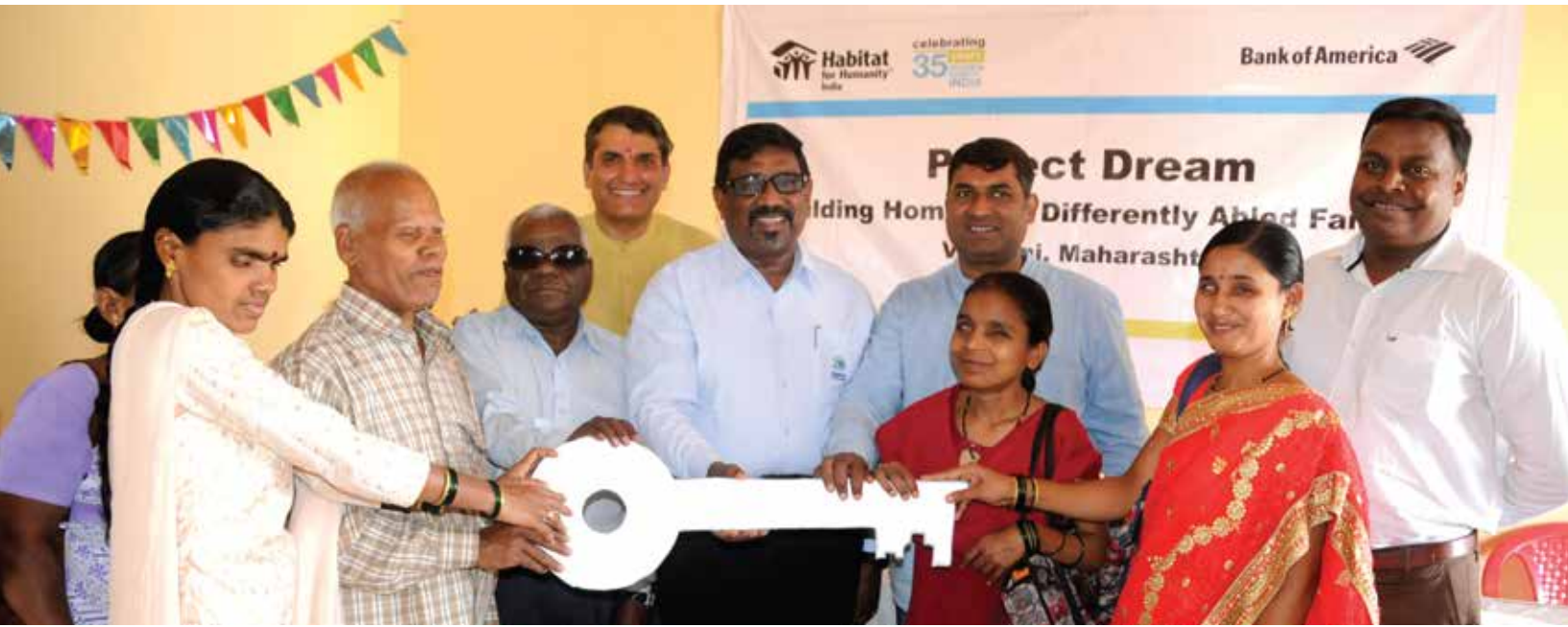
The families were invited for a handing over ceremony

After living in dilapidated makeshift houses, overcrowded conditions and apartments with escalating rents for years, 16 visually impaired families from Vangani now have realized their dream of living in a safe and a decent home. In partnership with BA Continuum India Pvt. Ltd, Habitat has built a multi-storied building providing affordable homes to these 16 families in Vangani.