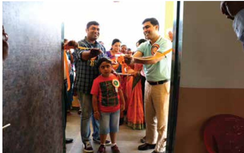
With the support from Altisoure, Habitat India has built 6 toilets, a multi-facility auditorium and a 6 feet high wall at Dnyansadhana Madyamik Vidyalaya in Manori.