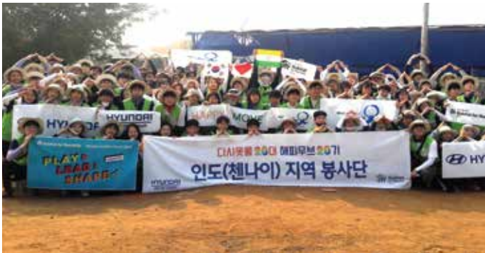
Participants at the Happy Move build

On 20th January 2018 over 200 employees from Altisource Business Solutions Pvt. Ltd., Samsung Construction and Technologies and Willis Towers Watson Mumbai helped build houses for 9 families at Bangarwadi, Karjat (Maharashtra).