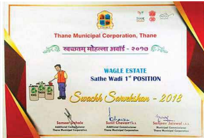
The sanitation complex built by Habitat India in Sathewadi was awarded the 'Swachhatam Mohalla Award' by Thane Municipal Corporation for keeping the surrounding clean and hygienic.