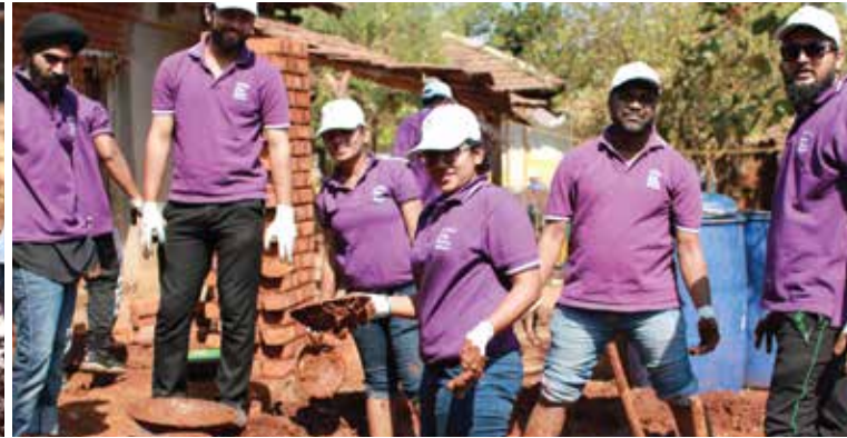
HYLB Big Build saw over 200 volunteers working on building decent homes