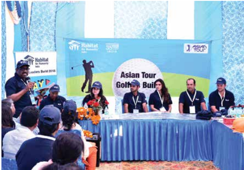
Inauguration of the Asian Tour Golfers Build