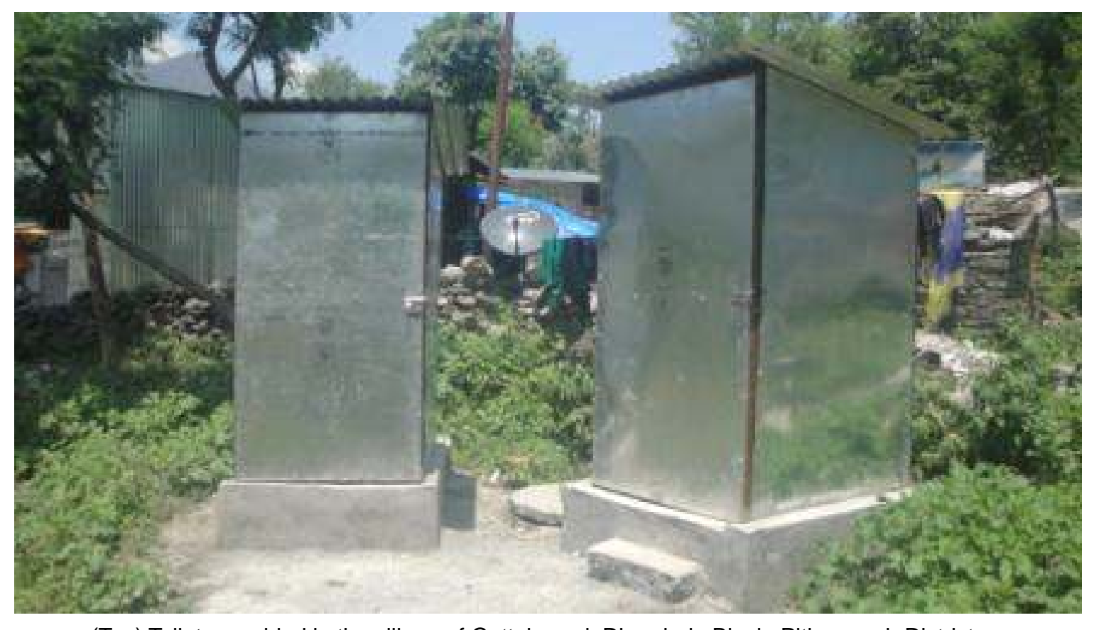
(Top) Toilets provided in the village of Gattabagad, Dharchula Block, Pithoragarh District.