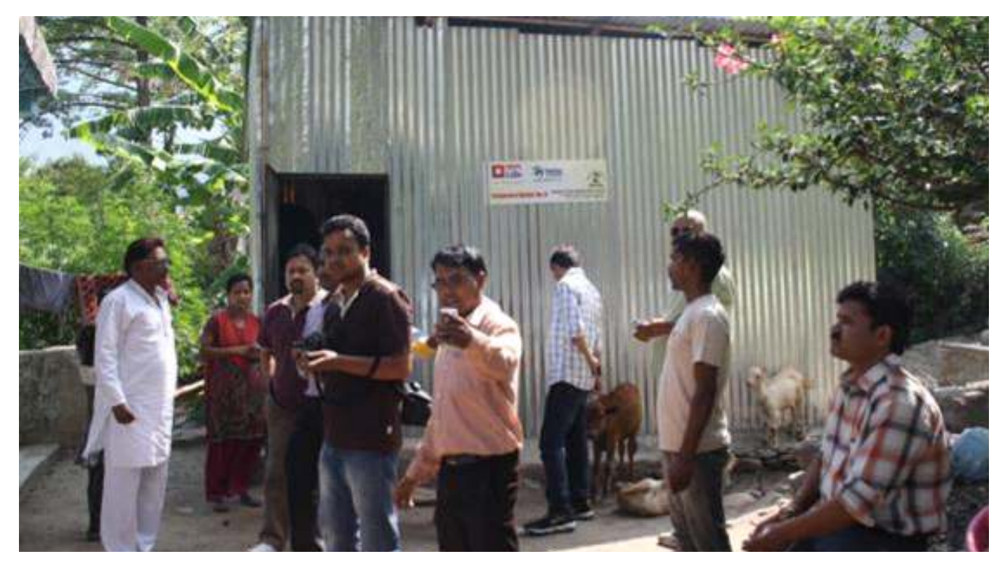
Staff from HDFC Life visiting the project site in Dharchula Block, Pithoragarh