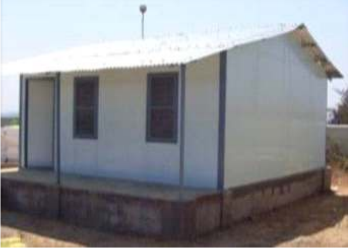
(Top Left) Start of foundation work for new permanent houses in Purola Block, Uttarkashi District. (Top Right) A proposed model for the new house in Purola Block, Uttarkashi District. Note: House models will vary depending on the partner organization and location.