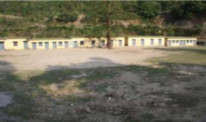
(Top) Government Inter-College School in Pithoragarh, an example of many schools in need of repair / rebuilding