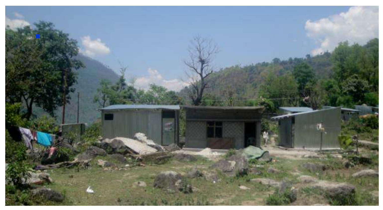
(Top) Transitional shelters in the village of Gattabagad, Dharchula Block, Pithoragarh District